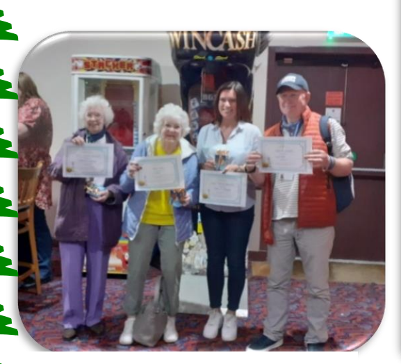
Befrienders receiving their Certificates during Volunteer Week